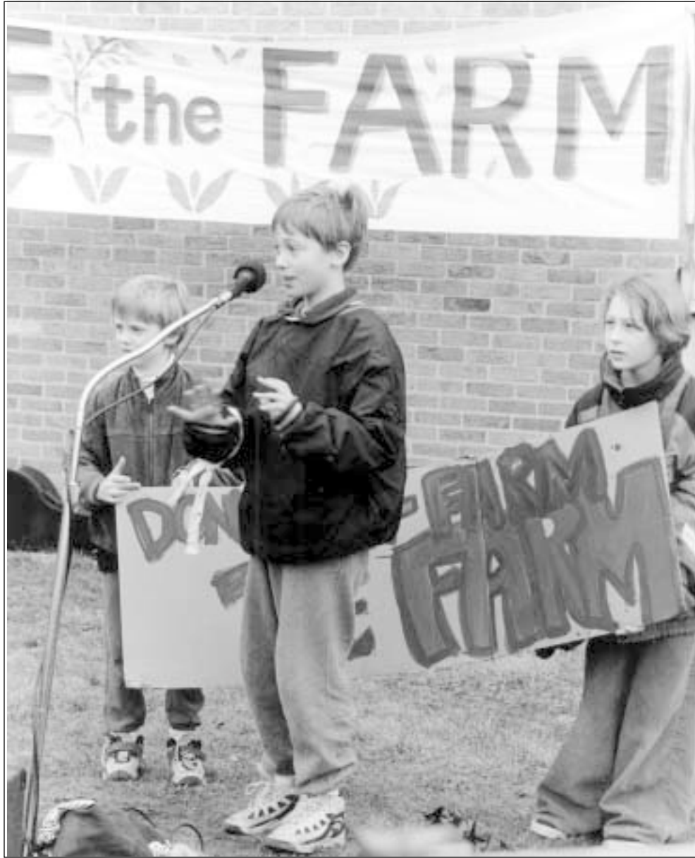
AT A COMMUNITY RALLY TO "SAVE THE FARM" YELLOW SPRINGS, OHIO, 1999